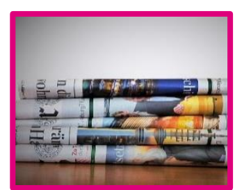
Wrap it in newspaper