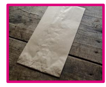
Dispose it in paper bags